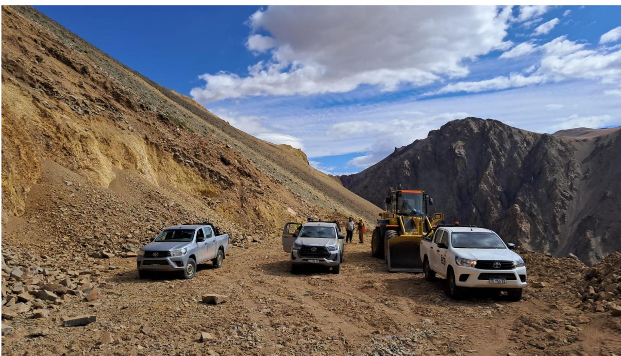
Figure 1 – Malambo Drill Pad 1.