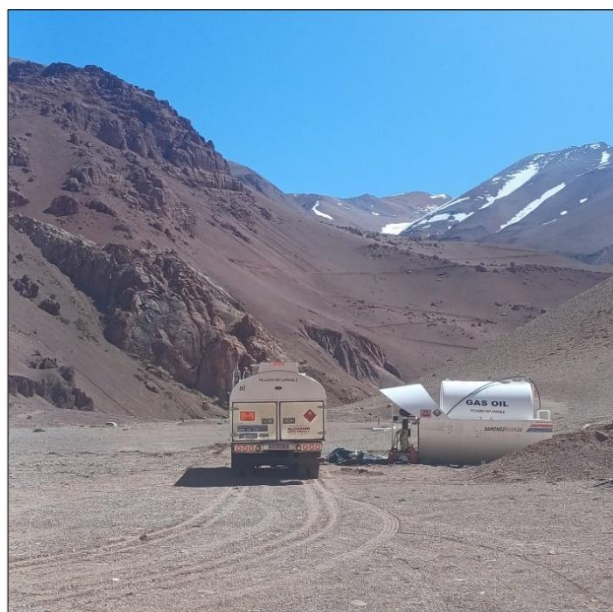
Photographs of the earthworks team clearing the access track and the fuel truck already refilling the fuel storage facility at the campsite.