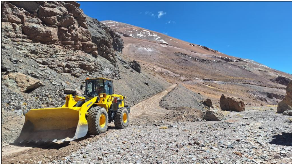
Figure 6: Earthworks machinery at the TMT Project