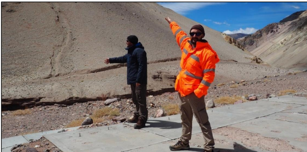
Figure 2: Assessing the conditions of the existing infrastructure, which is ready to be rapidly refurbished.