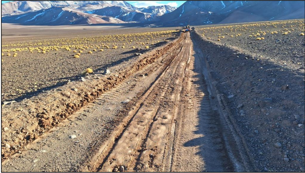
Figure 5: Earthworks machinery in distance repairing the TMT Project's Main Access Track