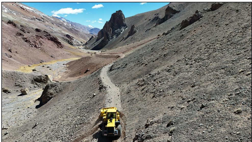
Figure 7: Drone shot capturing the restoration of the access track, track condition is prior to the first pass light vehicle upgrade works.