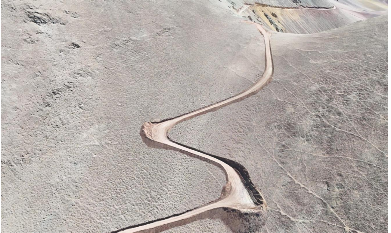
Figure 1 - Section of the newly constructed access track to Malambo drill targets.