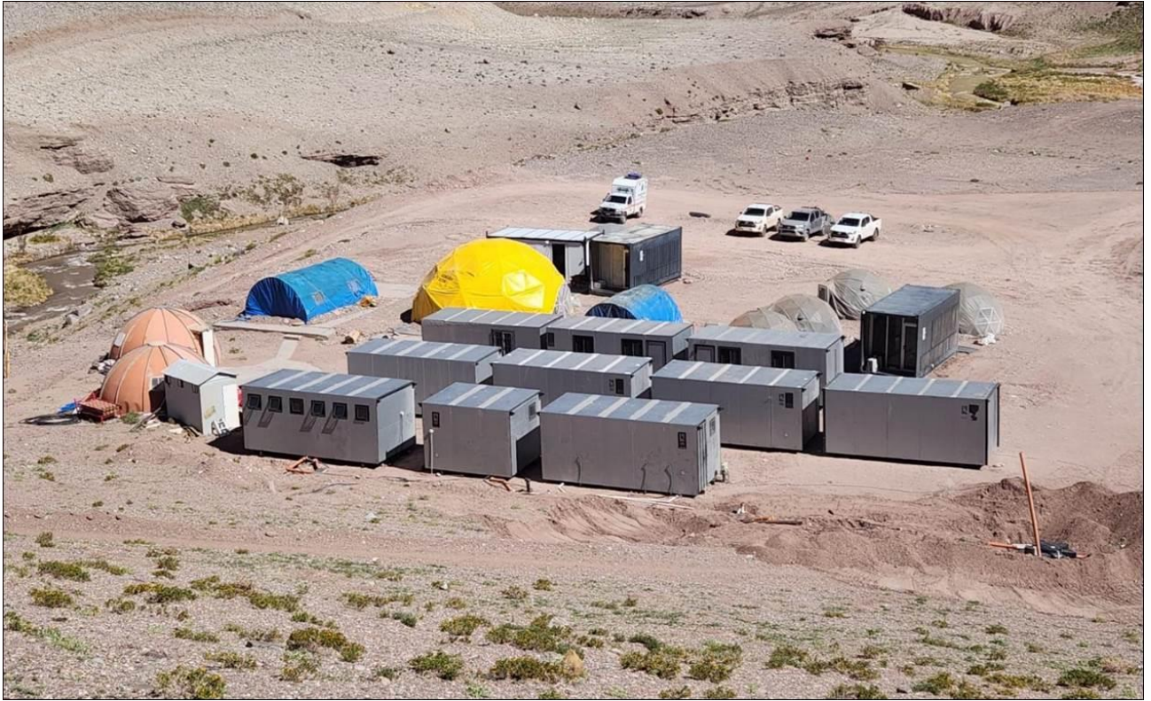
Figure 5 - TMT Camp is now ready for 55 persons fully furnished.