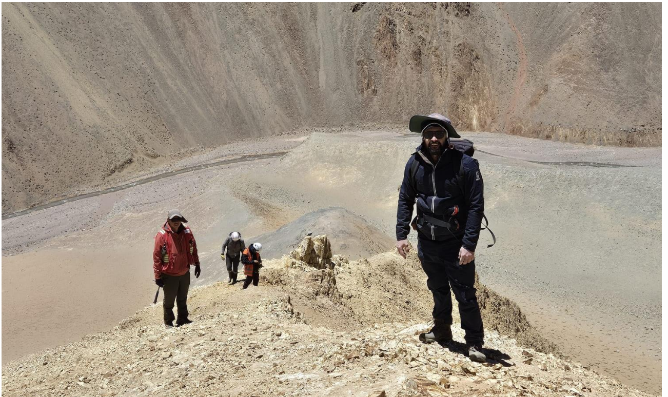
Figure 4 – Regional team at the Malambo target.