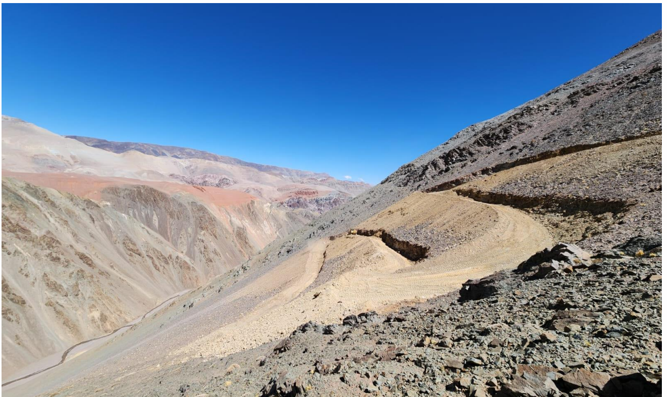
Figure 2 - Malambo access track through one of the rocky sections.