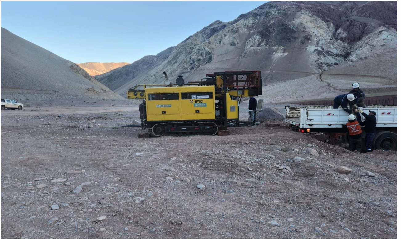
Figure 3 - Arrival of the first of Conosur's drill rigs at the TMT project.